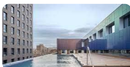
Hotel Paxton (15 steps away)