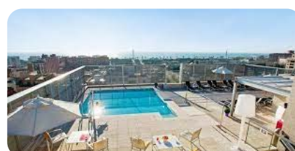
Hotel Ilunion Barcelona (20 steps away)