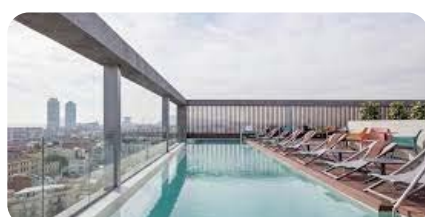
Hotel Acta Voraport (10 steps away)